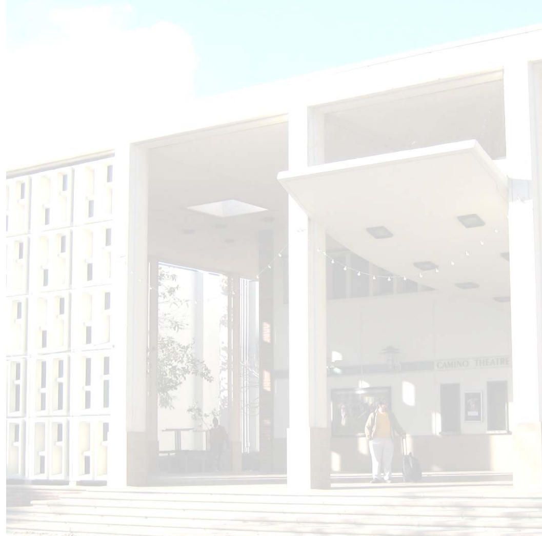
Office of Veterans Affairs