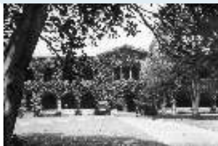
Los Angeles City College opened in 1929.