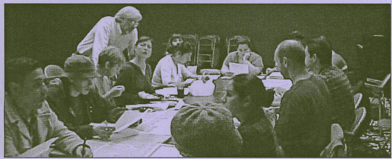
Production meeting in the Caminito Theatre for Student Directed One-Acts, 2000

Please turn off all cell phones and pagers during performance. The use of recording devices during performance is not allowed. Refreshments will be sold on the portico during intermission. Eating or drinking is not permitted in the theatre.