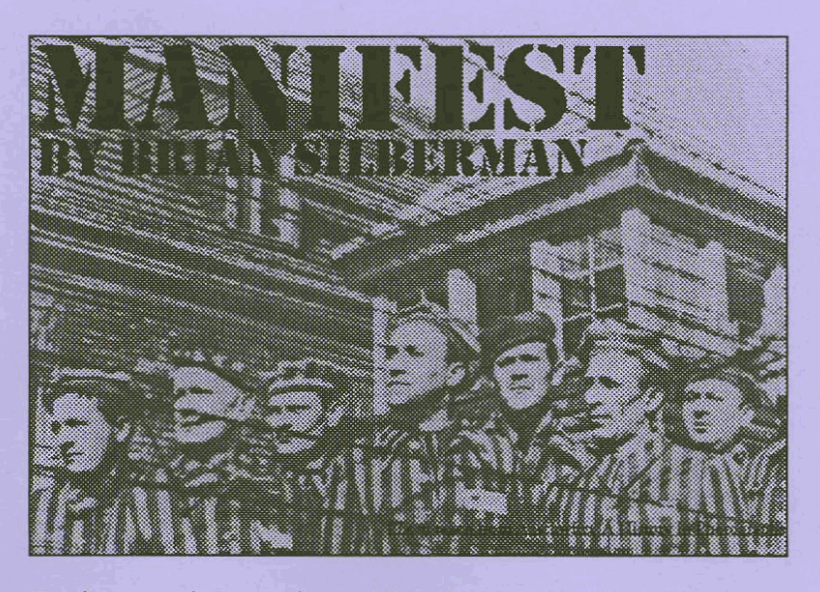
Fridays and Saturdays, May 5, 6, 12, 13 @ 8pm Thursday, May 11 @ 7:15pm Saturday Matinees, May 6 & 13 @ 2pm

Tickets: $10 General Admission, $6 Students/Seniors/LACC Faculty & Staff